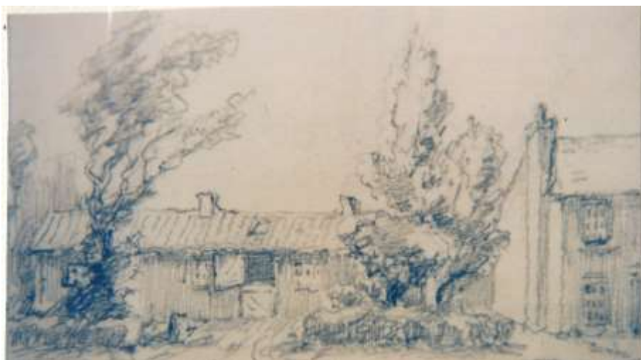
The forge and blacksmith's house, Harston