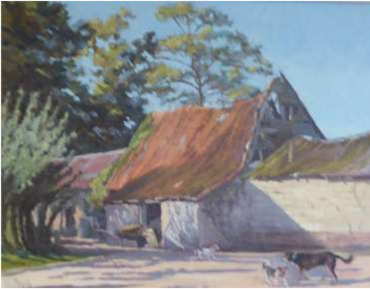
The old cart house before restoration, Harston House.