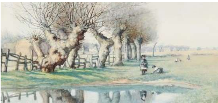
Pollarded elms, Harston (MutualArt.com)