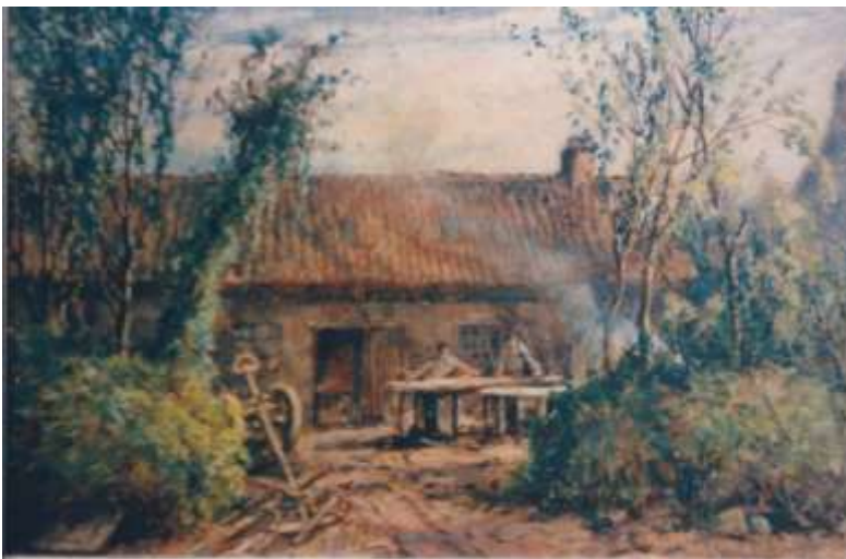
The Forge, Harston 1942