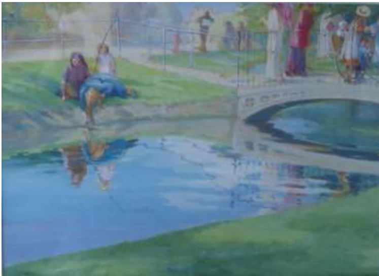
Brookside, Cambridge