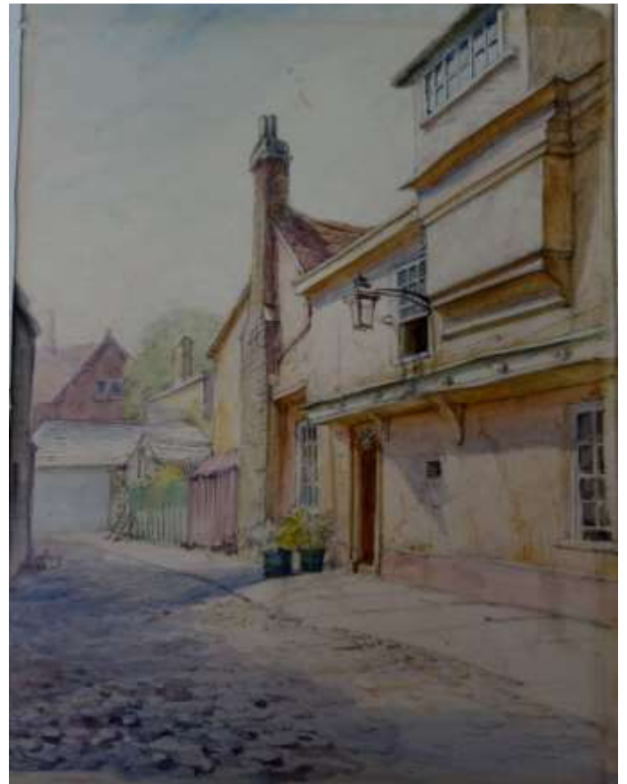
A yard off Trumpington Street (C Lees)