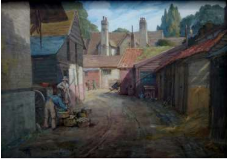
Old Castle Yard, 1912