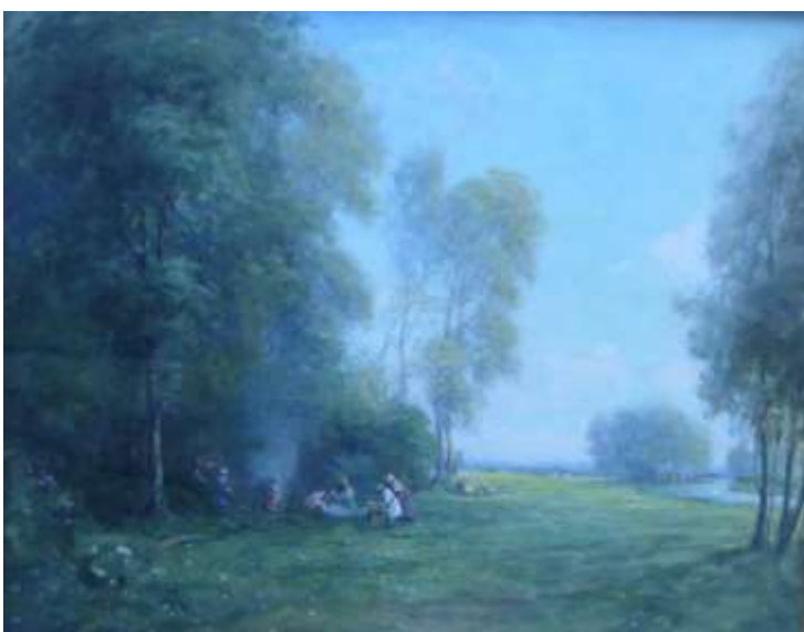
A picnic at Fen Ditton 1902