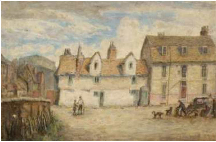
Red Lion Yard, Cambridge 1947