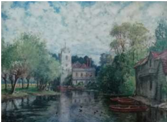
Possibly Hemingford Grey (F Clarke)