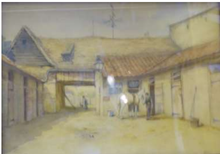
Brown's livery stable yard, Cambridge