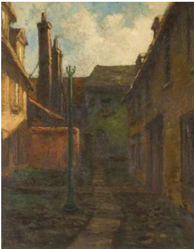
Wray's Court, Cambridge 1918