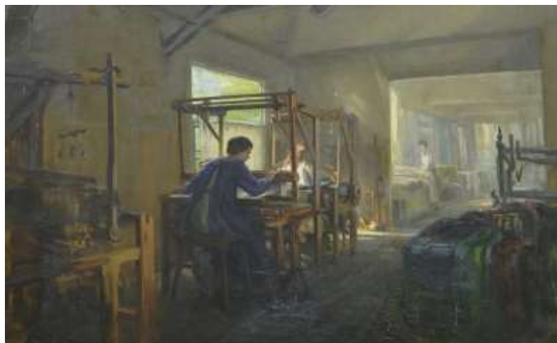
Weaving Room (MutualArt)