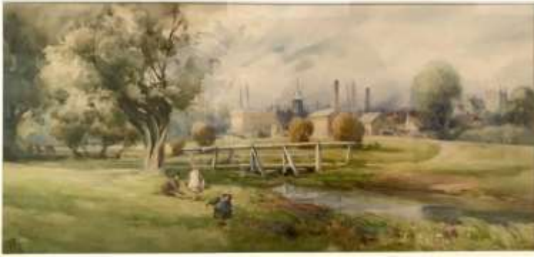
Coe Fen (C Lees)