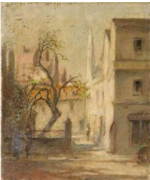
North side of St Edward's Passage (Museum of Cambridge)