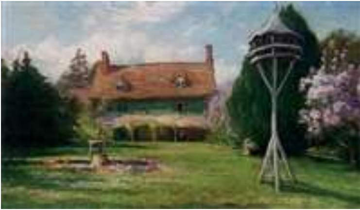
The Vicarage at Grantchester (ArtNet)