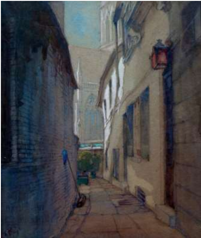
A yard near St John's Court