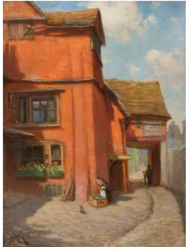
White Horse Inn, Cambridge 1909