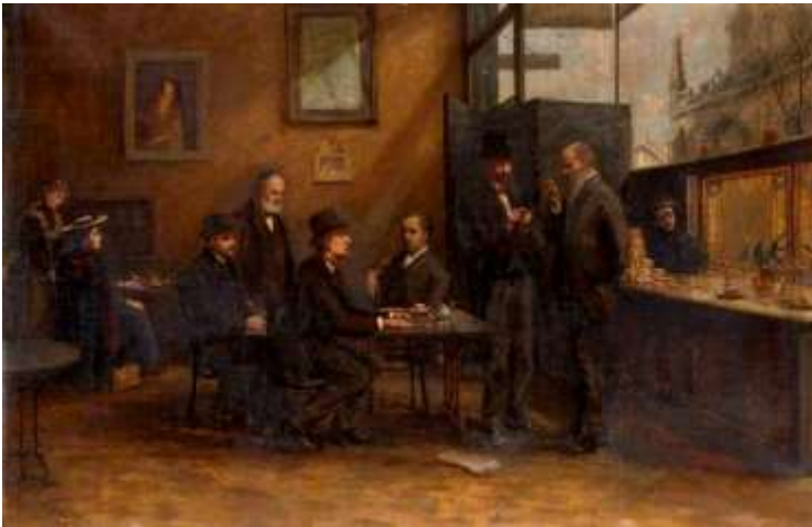
Albany Café (C Lees)