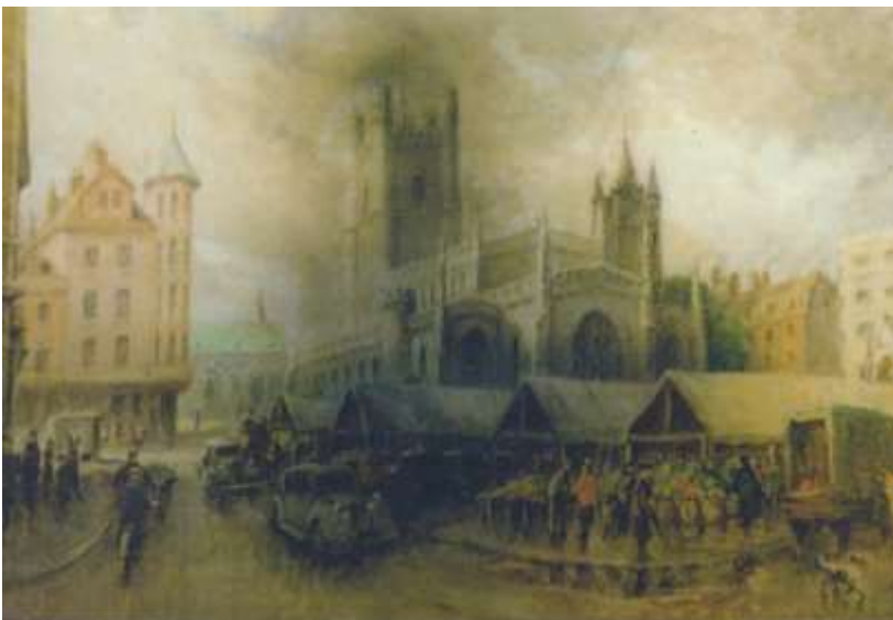
Market Square, Cambridge

"I usually had my lunch at the Albany Café, a little café with an atmosphere of its own. It had for some reason become the lunch place of many well-known Cambridge men. Whenever I sold a picture, I ordered sardines on toast, and apricots and cream. The meaning of the way I was regaling myself became known and I had congratulations from the habitués when they saw what was on my plate."