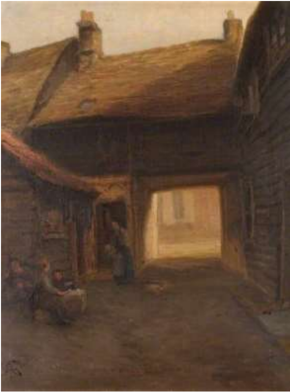
Quince's Court, Hobson's Yard (Museum of Cambridge)