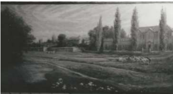
Coe Fen (looking towards the rear of Peterhouse and the Fitzwilliam museum)