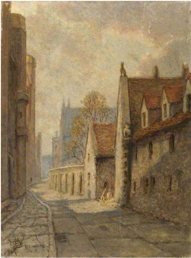
Free School Lane, Cambridge 1949