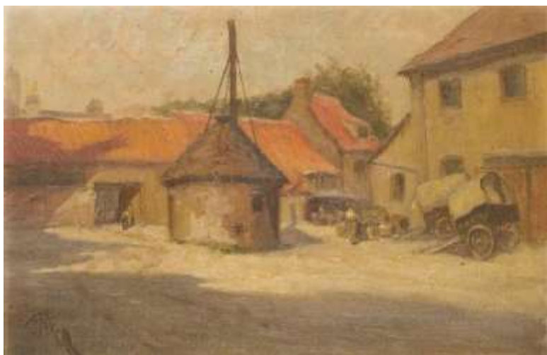
Sayles Yard, St Tibb's Row, Cambridge (Museum of Cambridge)