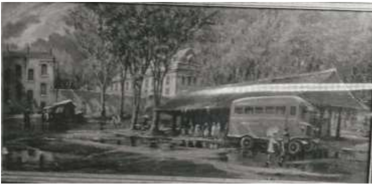
Autumn storm, Drummer Street Cambridge bus station 1942-44