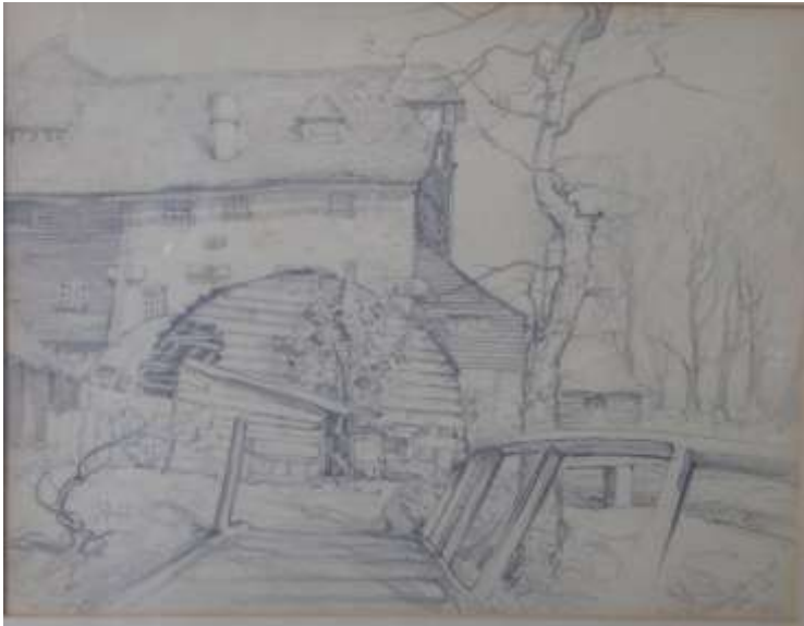
Houghton Mill