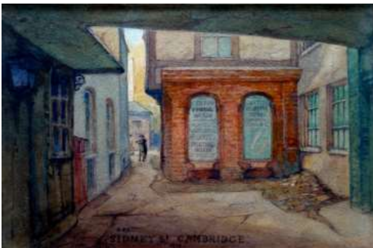
Caxton printworks off Sydney Street (C Lees)