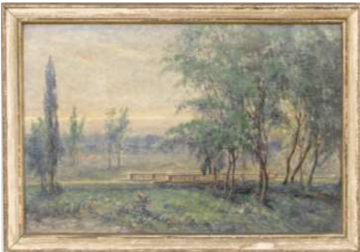
Lammas land or Coe Fen 1946