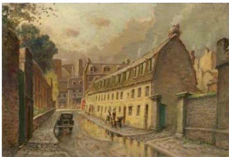
Emmanuel Street, Cambridge (Museum of Cambridge)