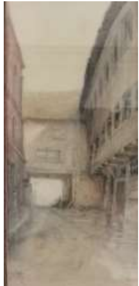
Falcon Court, Cambridge (Museum of Cambridge)