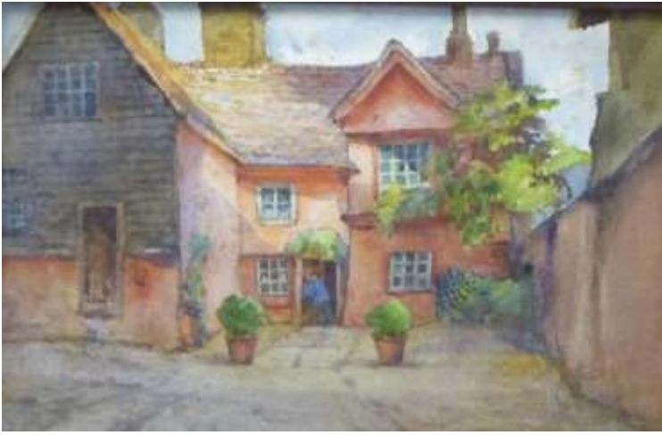
Front of True Blue Inn, Sydney Street, Cambridge (Museum of Cambridge)