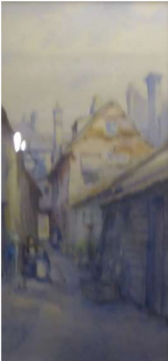
Yard off Granta Place (Museum of Cambridge)