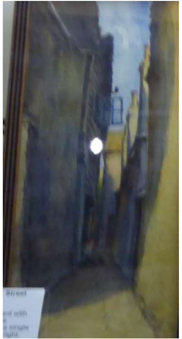
Unknown (Museum of Cambridge)