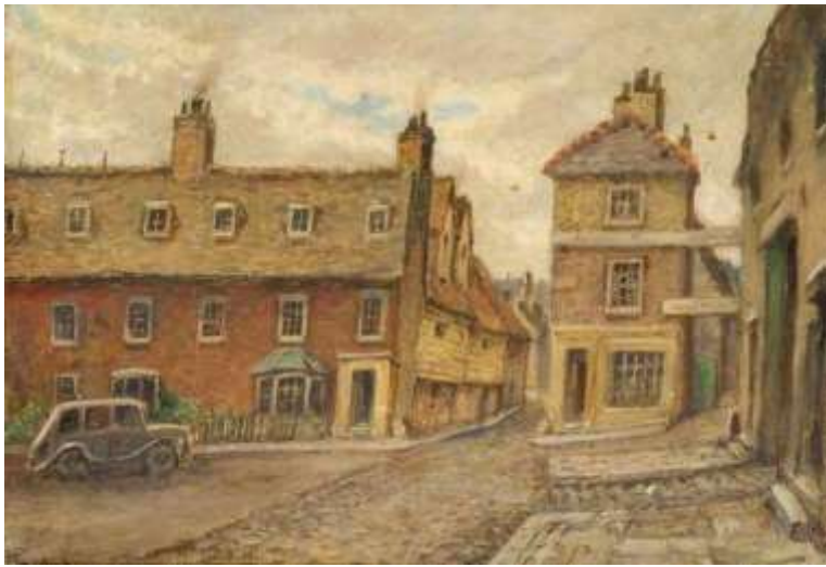
St Andrew's Hill, Cambridge 1947 (Museum of Cambridge)